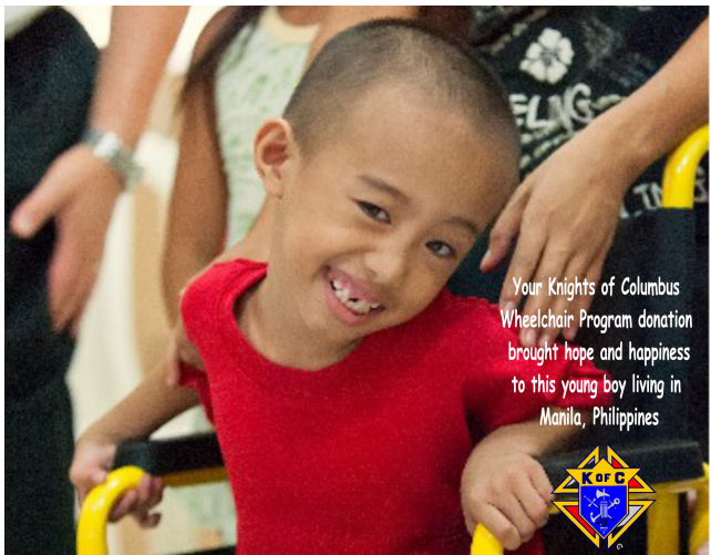
Your Knights of Columbus Wheelchair Program donation brought hope and happiness to this young boy living in Manila, Philippines